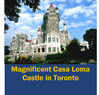
Magnificent Casa Loma Castle in Toronto