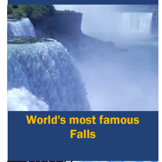
World's most famous Falls