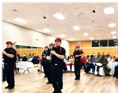
2019 Veteran's Event

In November, we honored the men and women who have answered the call to serve our nation. Thank you to everyone who attended this year's annual Veterans event. Please Save The Date 11/6/20 for next year's annual Veteran's event..