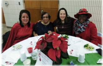
2019 Holiday Celebration