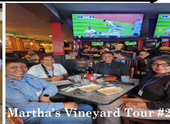
Martha's Vineyard Tour #2

~Family members, you are always in our thoughts.~