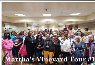
Martha's Vineyard Tour #1