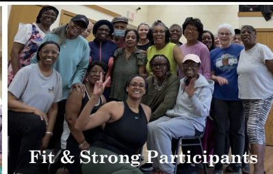
Fit & Strong Participants