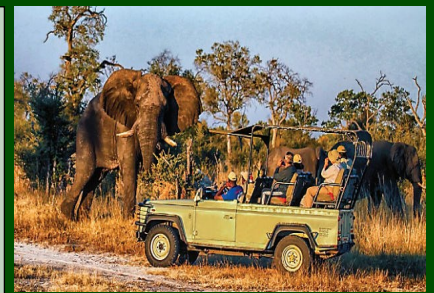
Safari Game Drive