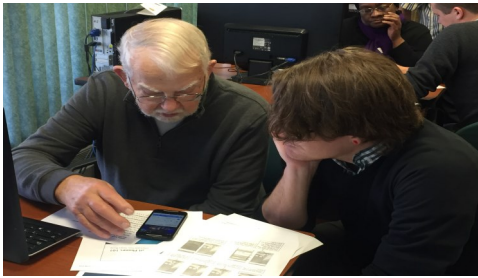
Technology Classes at Park Place - 414 S. Lewis Ave To Register Call 847-244-9242 or Email lpable@waukegantownship.com