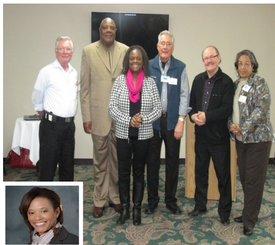
Pictured above: Members attend the 2015 Senior Citizens Service Members Annual Retreat Feb 4, 2015 at the Ramada Inn.

years. He's a member of the Senior Citizens Service Committee for 3 years and was a recipient of the Men of Distinction award in 2013. He's a recipient of the LCCS Volunteer of the Year Award in 2014.