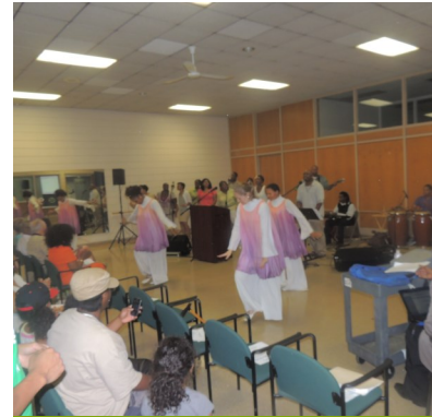
Members of the Community enjoying the program