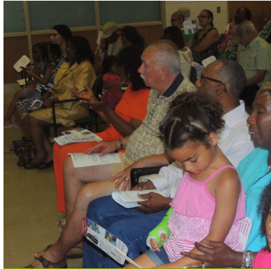
Members of the Community enjoying the program