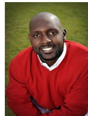
Keynote Speaker Desmond Clark

If you were unable to join us this year we hope that you will be in attendance for the 2015 Golf Golf Outing.