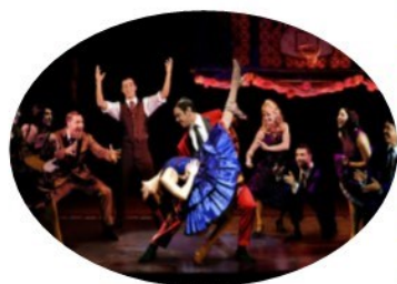
West Side Story