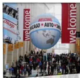
Chicago Auto Show

October 2015. $2198 per person (Double Occupancy) 10 Day Excursion featuring: A City tour of Boston with a local guide, Cruise along Maine's rocky shoreline and wooded islands of Casco Bay, Enjoy a delicious lobster dinner with all the fixins' on Cape Cod, and Ride the Conway Scenic Railway through New Hampshire's White Mountains.