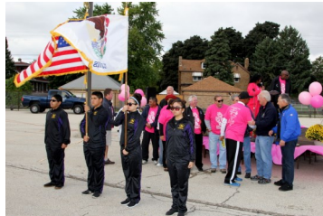
2014 5K Run/Walk For Seniors

Monday 9:00 AM - 7:00 PM Tuesday 9:00 AM - 4:30 PM Wednesday 9:00 AM - 4:30 PM Thursday 9:00 AM - 8:00 PM Friday 9:00 AM - 4:30 PM Saturday 9:00 AM - 3:00 PM Sunday Closed